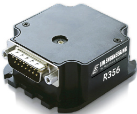
Single Axis Controller+Driver R356