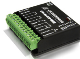
Microstepping Driver R701P-RO